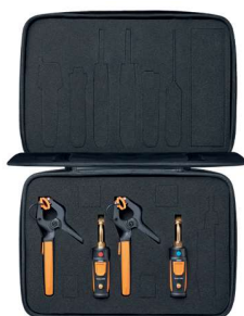
AC & Refrigeration Kit: 0563 0002 20