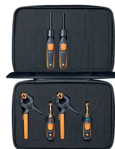
AC/R Test & Load Kit: 0563 0009